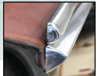
1969 and 1970 hood lip moulding shown side by side for comparison. The smaller one (above) is for a 1970.

An excellent reproduction of the Hood Lip Moulding support is available today thru Muscle Car Research: